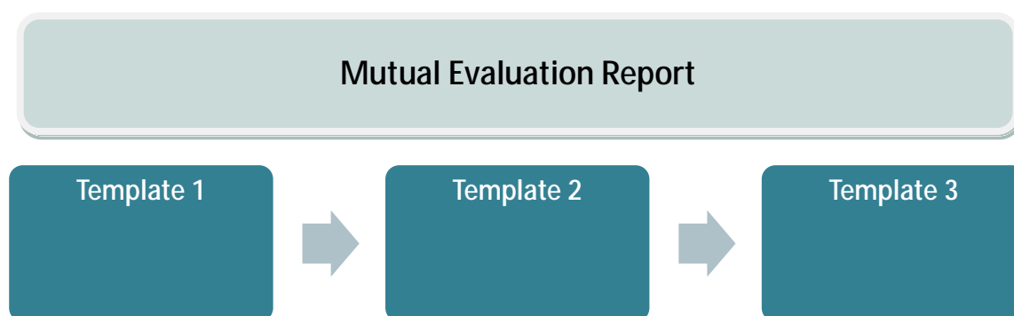
Figure 3. SIP framework